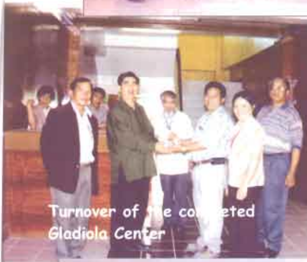
Turnover of the completed Gladiola Center