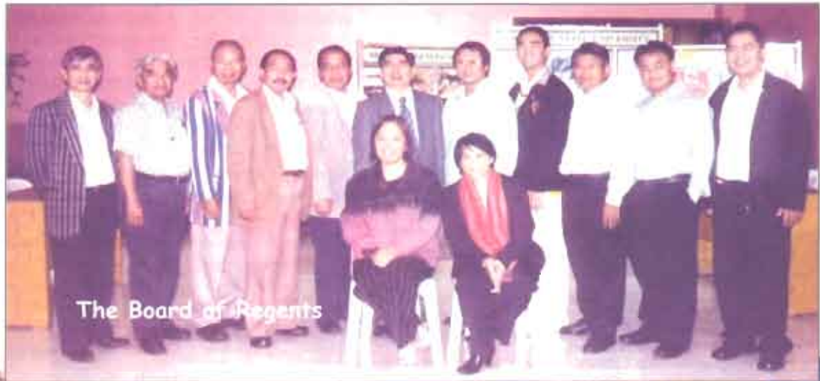
The Board of Regents