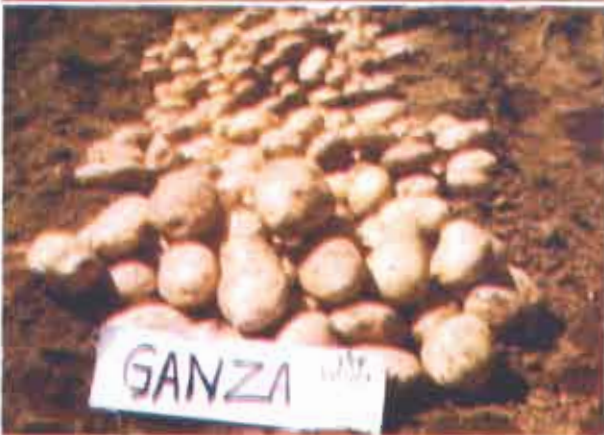
New Potato Variety IP 84004.7 (GANZA)