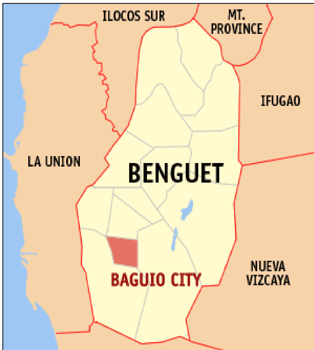
Figure 1. Map of Benguet showing the locale of the study