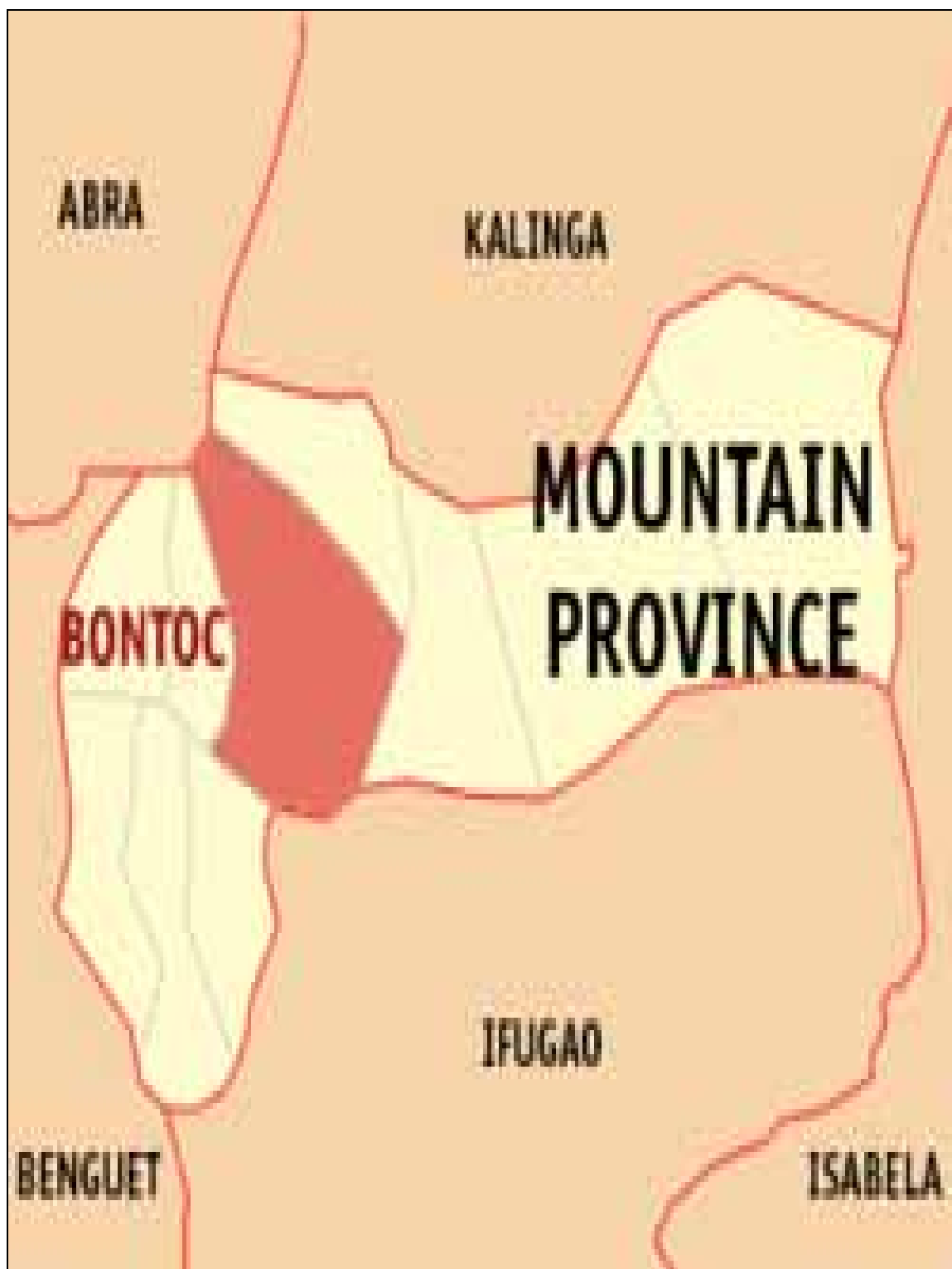
Figure 1. Map of Mountain Province showing the location of the study