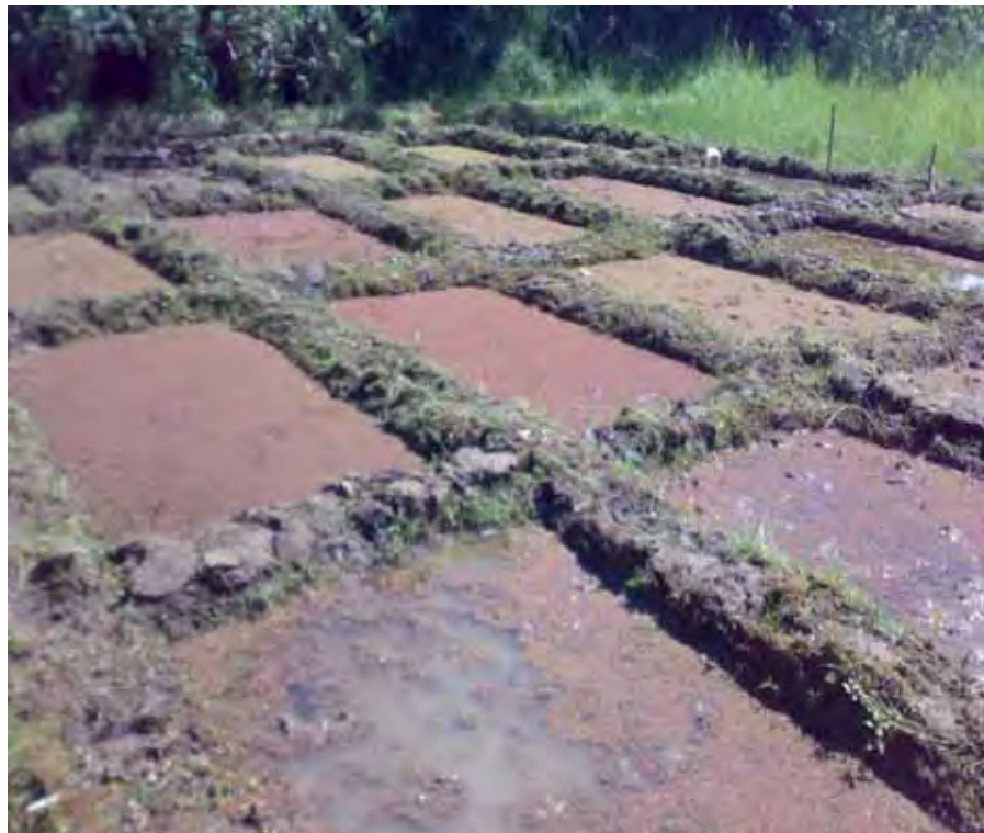
Figure 1. Field layout of the experimental area located at the BSU organic demo farm, La Trinidad, Benguet