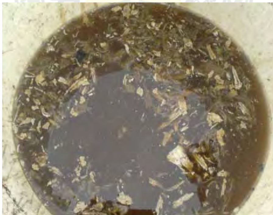
Figure 2. Fermented chopped sunflower, banana trunk and molasses as liquid organic fertilizer