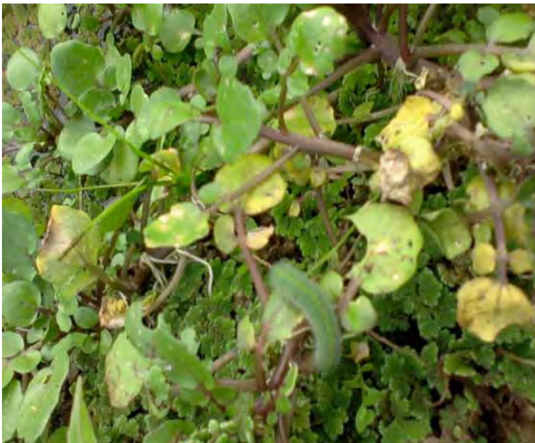
Figure 3. Aster yellow disease and cabbage worm infestation