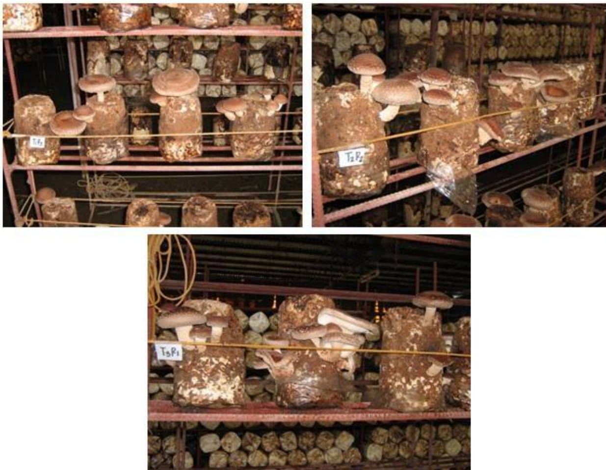
Figure 3. Yield on fruiting bags having chipped Alnus increasing from 21 parts, 42 and further to 63 parts indicate potential of adding such chips into the substrate for organic production of shiitake

It follows that the biological efficiency is highest (49.88%) in the treatment combining 65% chipped Alnus of 3 - 4 mm particle size and 16% sawdust of 1 - 2 mm particle size; turning about half of the main substrate weight into mushroom.